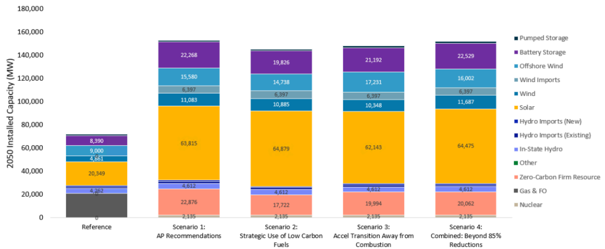
Figure 30. Installed Capacity in 2050, All Scenarios 35

The E3 report commissioned by NYSERDA and DEC and included as Appendix G of the Climate Action Council (CAC) Scoping Plan does not use the term DEFR. The resource type that Brattle refers to as DEFR, depicted in the figures excerpted from the E3 report on page 1 of the Blueprint, is “zero-carbon firm capacity.” E3 does not define the attributes of this resource type with any degree of specificity, so it is not clear what attributes it represents. The report says that the modeled resources are hydrogen-fueled turbines and fuel cells, but that “[f]irm zero-carbon capacity needs could be met by a number of different technologies,” including nuclear. However, the model scenarios that E3 provides suggest that its zero-carbon firm resources would operate at very low capacity factors, ranging from 2.6% to 4.5%. (See the figures excerpted from the report below.) To operate at such low capacity factors, these resources would have to operate with high degrees of intermittency. Using nuclear generation as such a resource would raise the unit cost of generation by more than a factor of 20, making it thoroughly uneconomic as a DEFR or source of zero-carbon firm capacity.